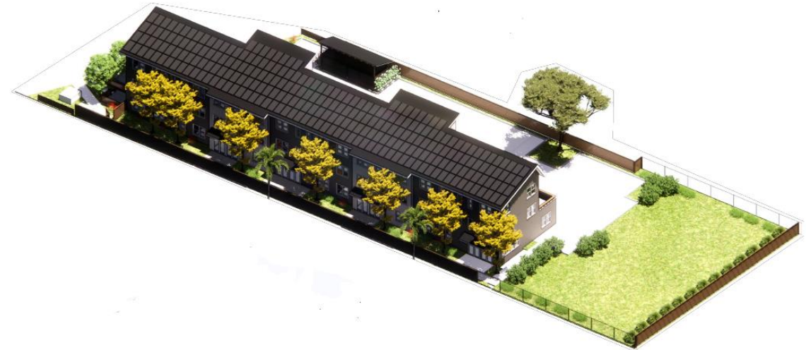
View from De La Cruz Boulevard Looking North