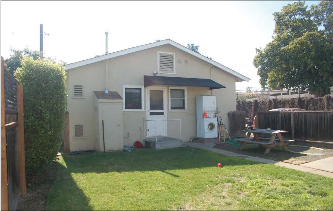
645 Benton Street – rear façade and back yard