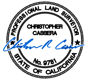
EXHIBIT "B" PLAT TO ACCOMPANY LEGAL DESCRIPTION

K: \2021\212368_3378-3386_E_ECR\SUR\DWG\ESMT-VACATION\212368_VACATION.DWG