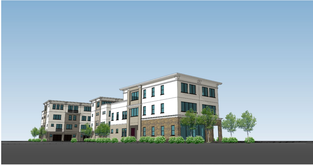
View from Aviso St