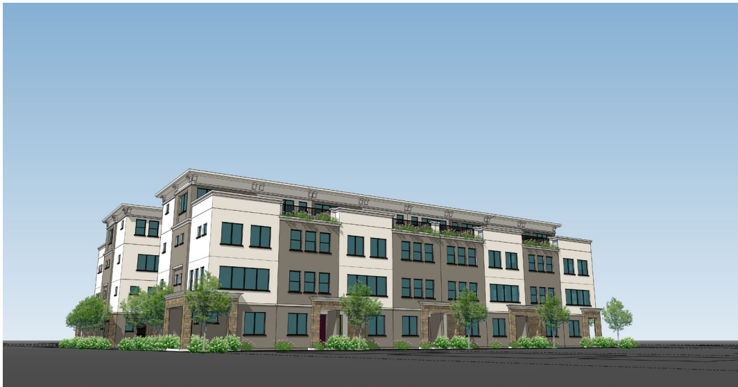
View from West