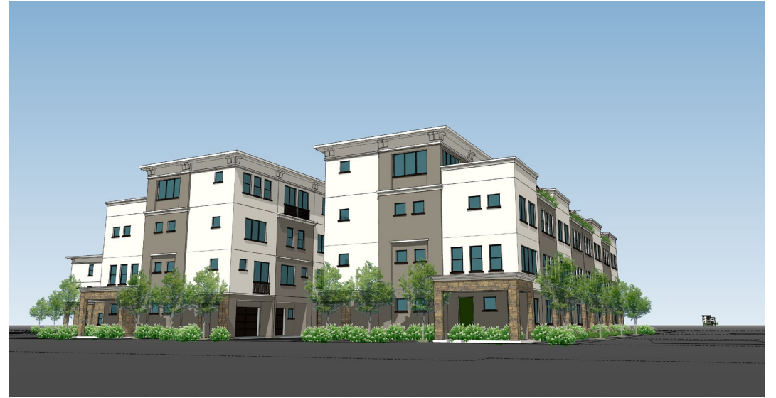
View from Civic Center Dr