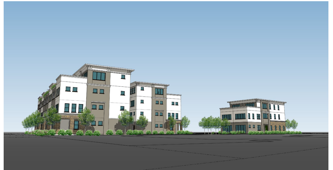
View from South-East