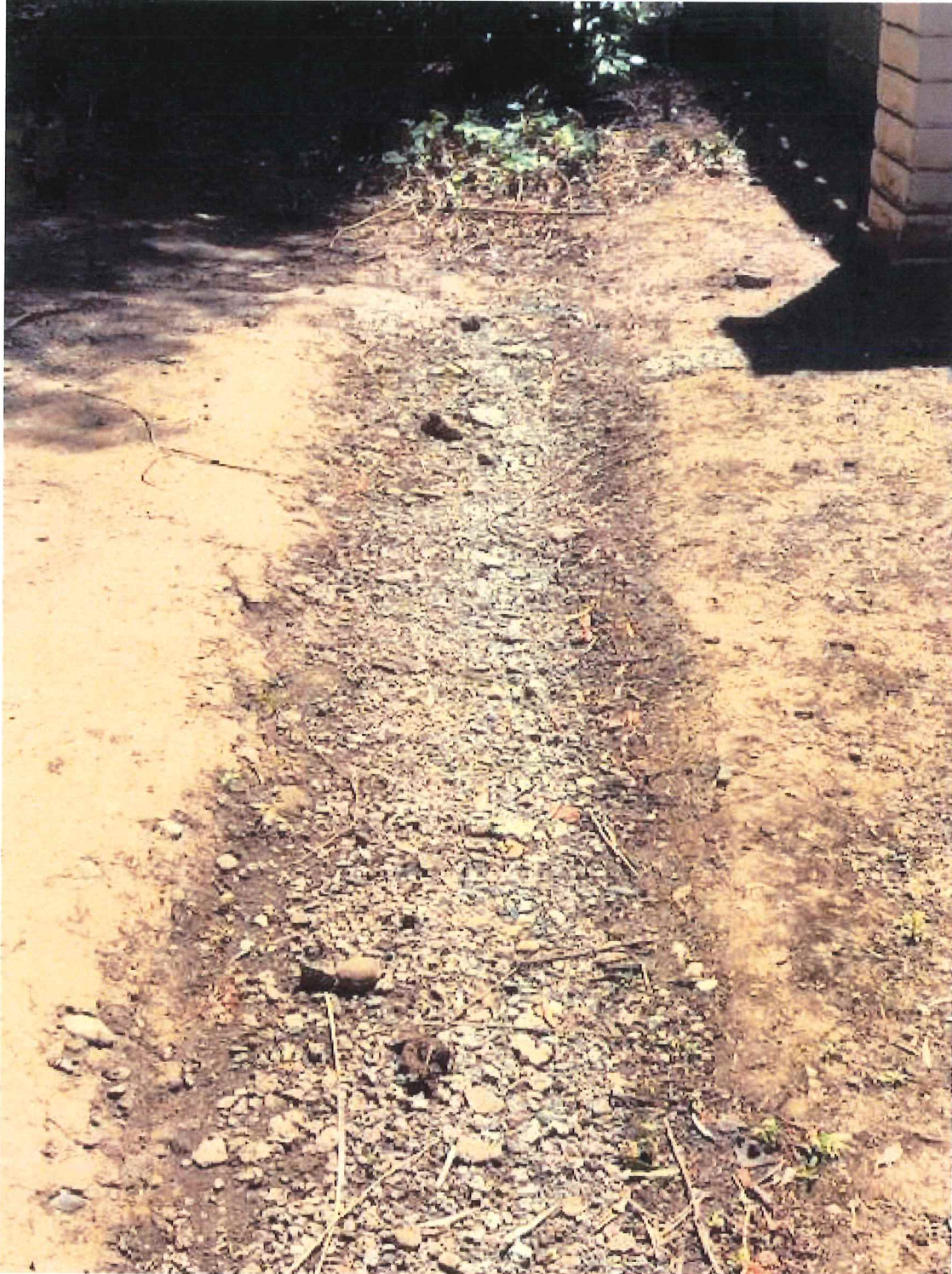
The area along the fence with Triton Ct, right behind Triton Ct homes, where a driveway is proposed, was used as bathroom on a regular basis. A mitigation fence would have reduced incidences like this.