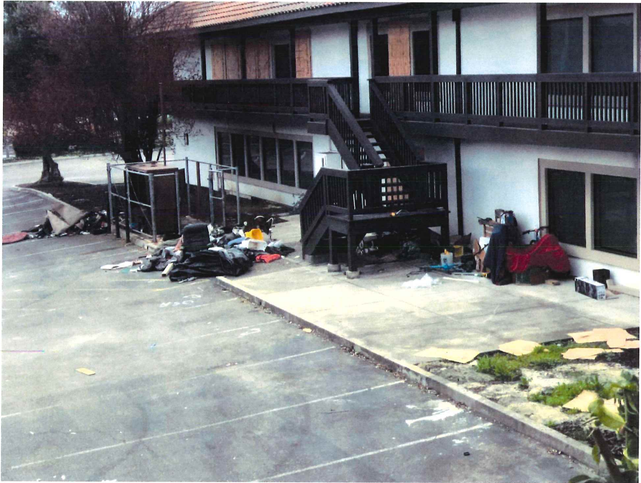
Trash from the encampment. The fence around the enclosure could have been removed in April 2020, not March of 2021.