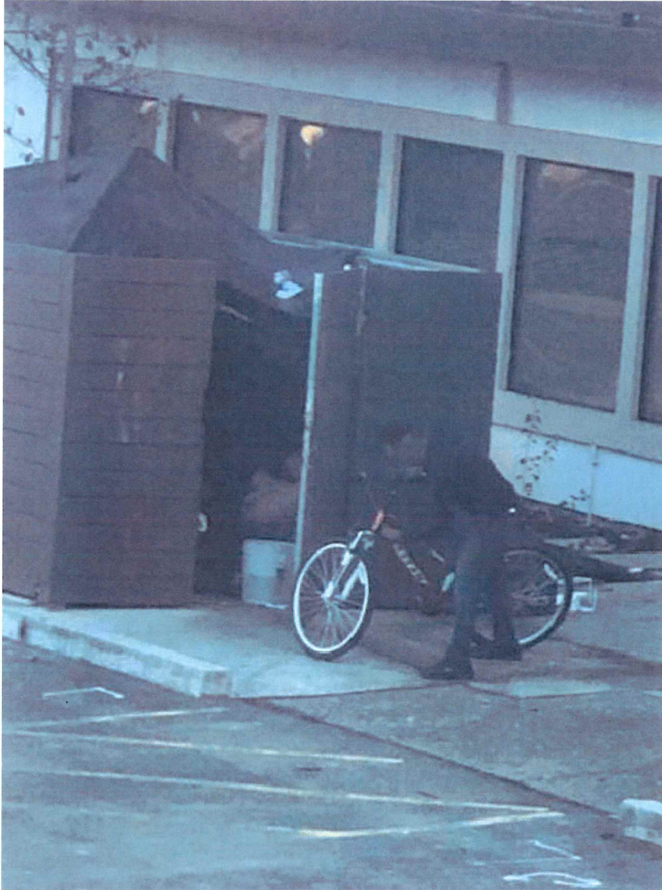
Tent inside the enclosure operated 24/7 – Brawls between occupants were common with multiple police dispatches. Bicycle thieves assembling/disassembling stolen bike parts operated next to the tent.