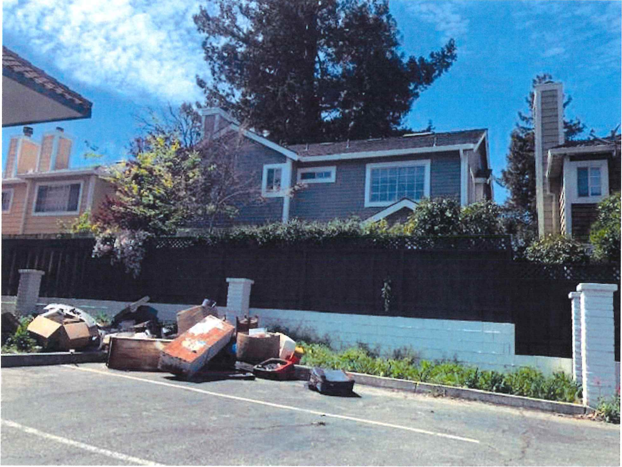
Only one of several dumping incidents which could have been prevented if the owner of 1601 had placed a fence around the perimeter.