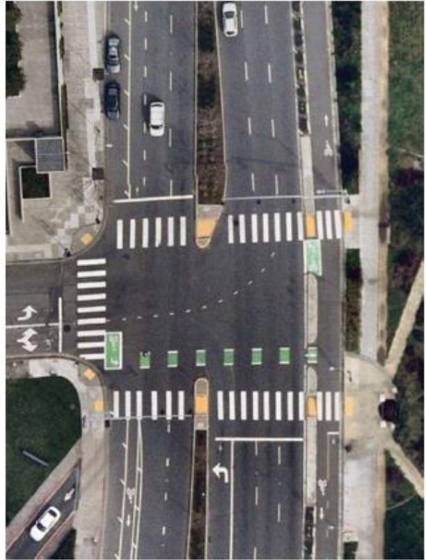
Location: Harrison Street & 21st Street, Oakland, CA