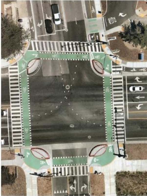
Location: Madonna Road & Dalidio Drive, San Luis Obispo, CA