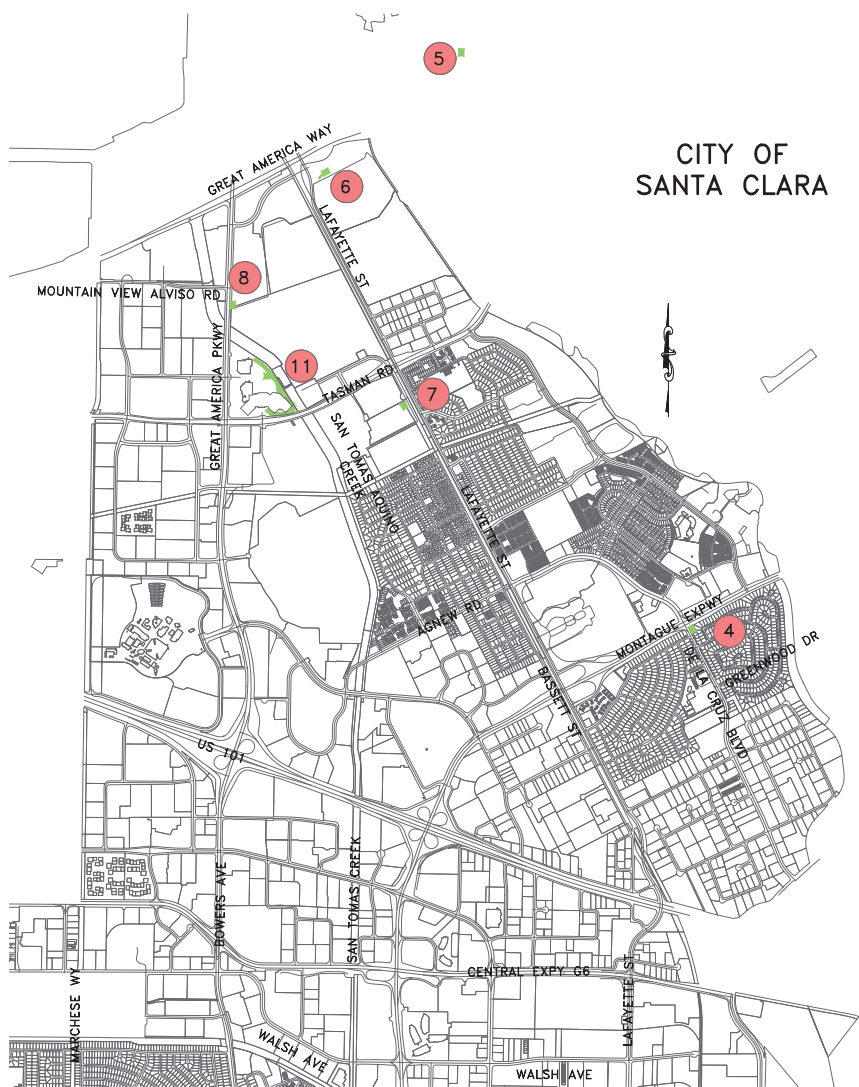
KEY MAP NO SCALE