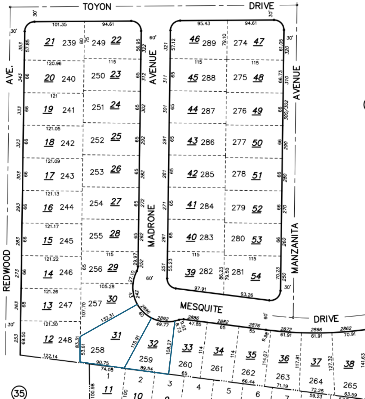
Exhibit A: Vicinity map ( 32 – 2892 Mesquite Dr., 31 – 2896 Mesquite Dr.)