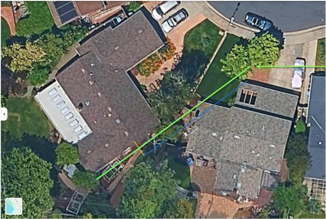
Exhibit B: Sight line prior to February 17 2026

Sight line at 4.5 ft from home wall (tangent to 2892 corner)