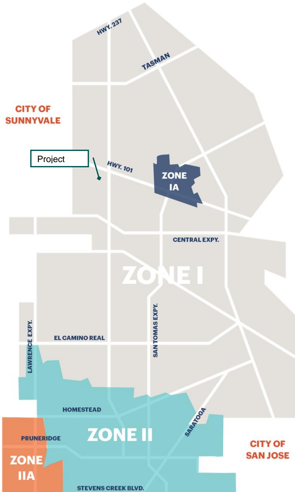
Figure 1: Pressure Zones