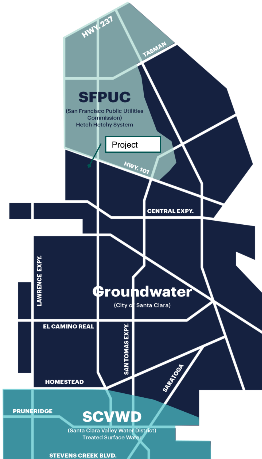
Figure 2: Sources of Water by Area