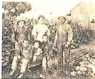
Saw California Grow