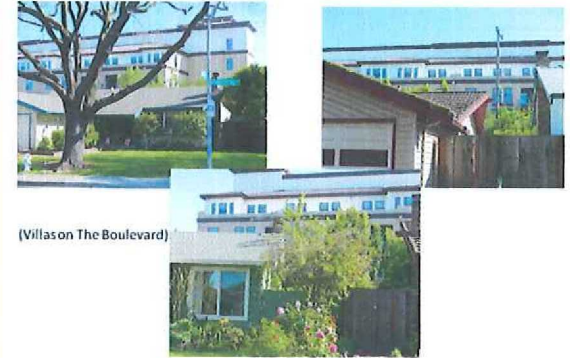
(Villas on The Boulevard)