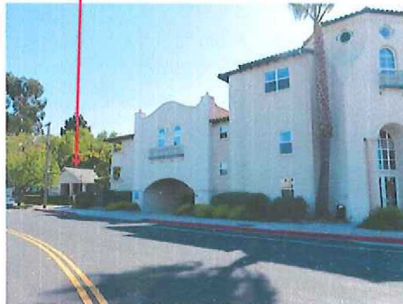
Camino Main Place

Ask this neighbor if the city preserved the neighborhood.