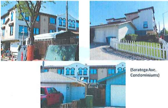
(Saratoga Ave. Condominiums)

Ask this neighbor if the city preserved the neighborhood.