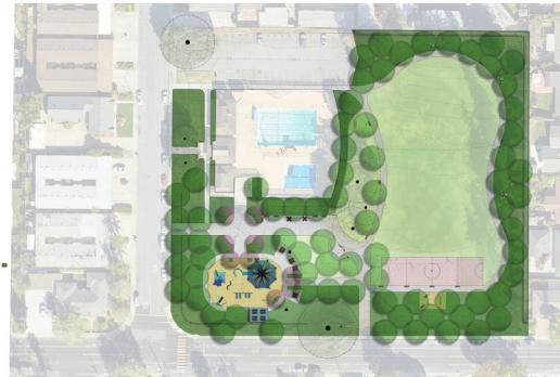
Project estimate $5 million