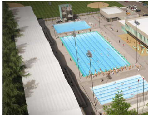
Project estimate $31 million

Indirect for pedestrian and/or bike routes with partial road closures along Patricia Drive and pathways adjacent to ISC