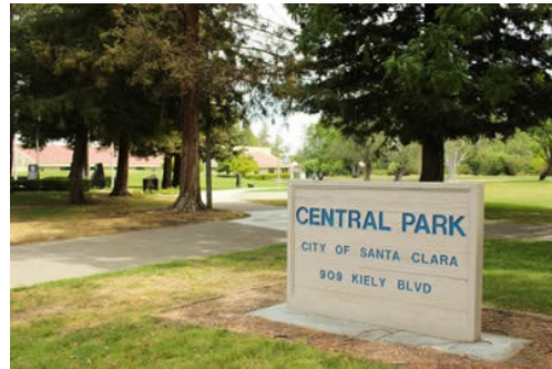
Project estimate $7.2 million

Partial road closure on Keily Blvd. along with sidewalk closures