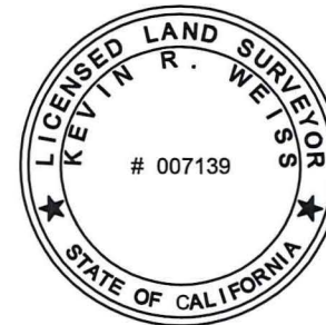
EXHIBIT 'B' EASEMENTS VACATED FOR 3650 KIFER ROAD SANTA CLARA, CALIFORNIA