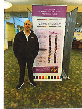
The Coming Out Exhibit during its visit to Santa Clara Main Library