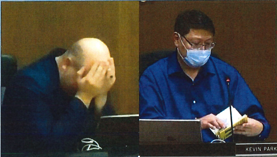
From Public Trust Review – Episode 20: https://youtu.be/kk0PBXjgcog