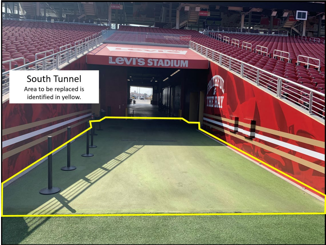
South Tunnel Area to be replaced is identified in yellow.