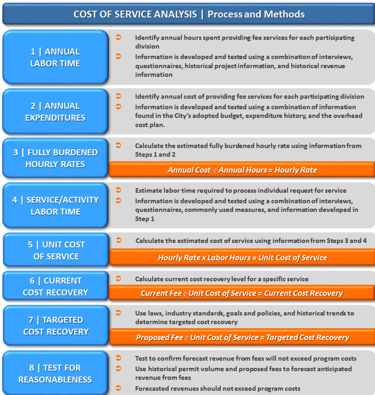
EXHIBIT 2 | STEPS IN ANALYZING COSTS OF SERVICE AND USER FEES