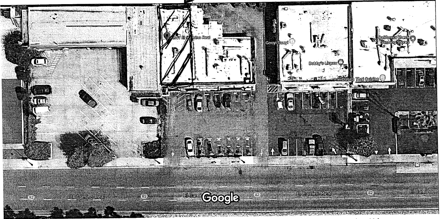
Imagery ©2019 Google, Map data ©2019 Google 20 ft