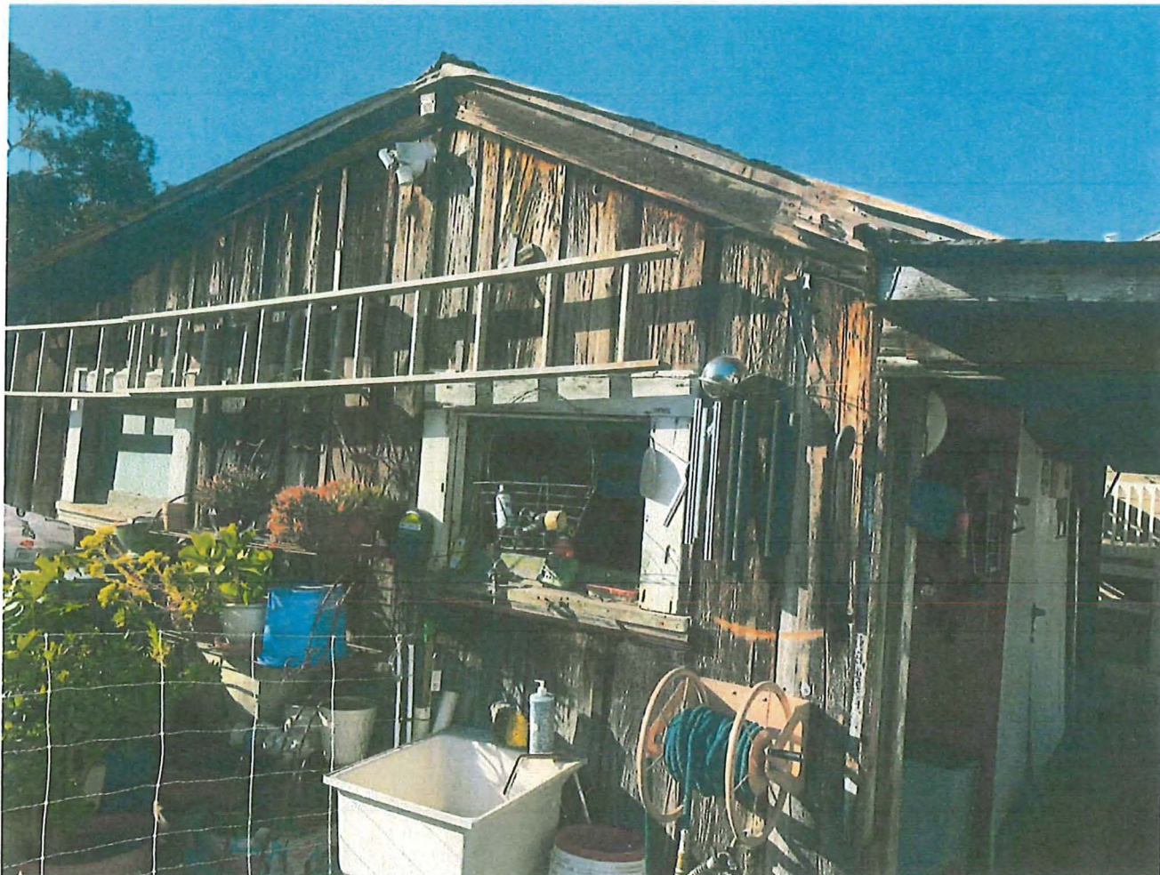
Front of the shed showing the various sizes of wood boards and condition of the shed.