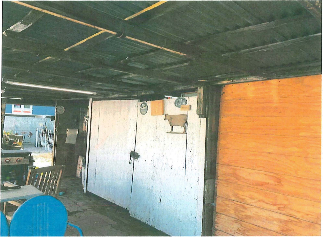
Interior of the shed partitioned for storage and salvaged building materials. Floor is salvaged roofing and tile.