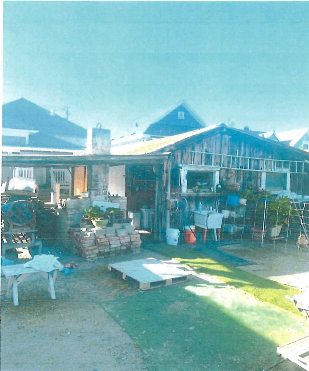
Front of the shed facing into the rear yard. The overhang and side addition were constructed at the same time as the peaked roof section. All materials are salvage.