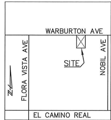
LOCATION MAP NTS

AREA OF ENCROACHMENT [4.5 FOOT TALL WROUGHT IRON FENCE AND TWO VEHICLE GATES]