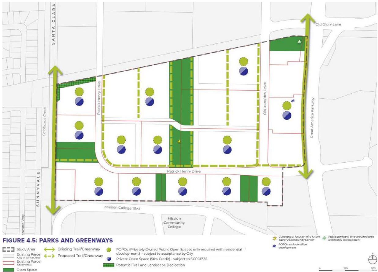
Figure 4.5 below serves as an example of a typical layout for the figures above regarding the open space option.