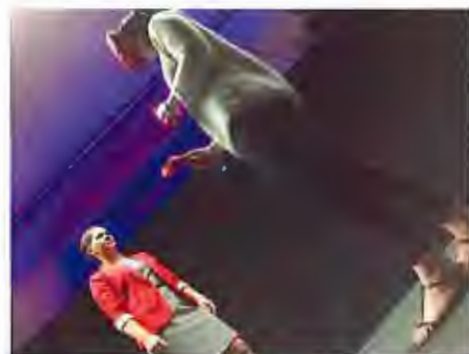
Virtual Reality Lab