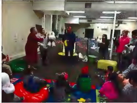
Family Literacy Outreach