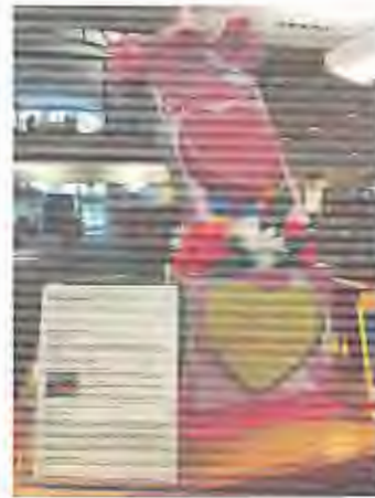
Kaiser Permanente Health & Wellness Collection & Programs