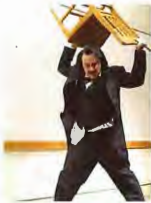
Thousands of Classes, Programs and Events