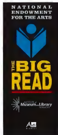
2011 Big Read