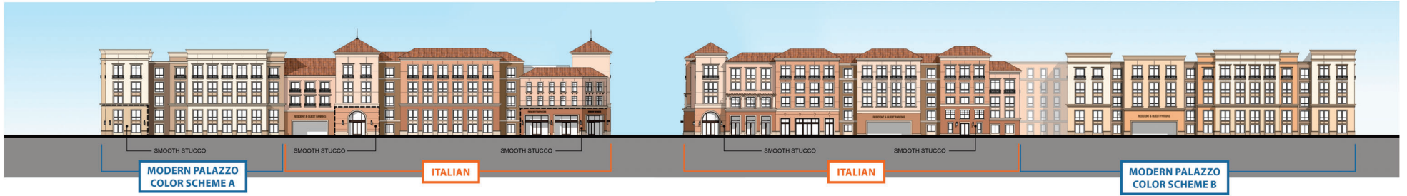
PRIVATE STREET A ELEVATION SOUTH