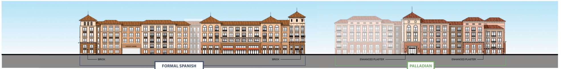
PRIVATE STREET A ELEVATION NORTH