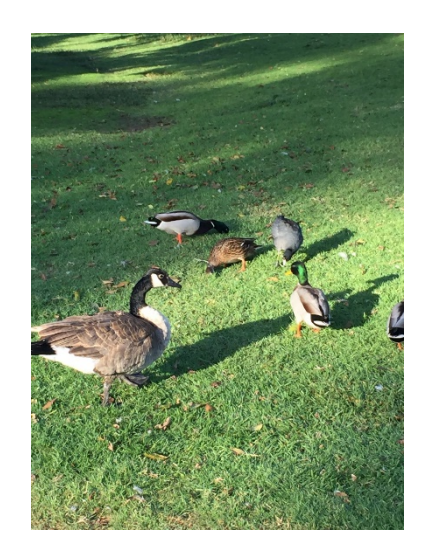
Image 3. CAGO overpopulate the Central Park area for several reasons, including the abundance of lawn areas that offer plentiful, year-round foraging resources — with green grass always present and growing profusely due to its excellent health.

Image 1. CAGO and Mallard are the two most common bird species to see at the Central Park Lake area.