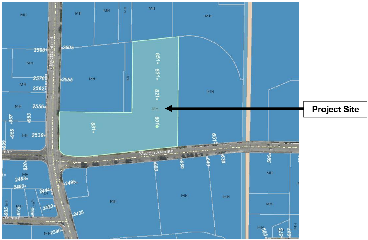
General Plan Map