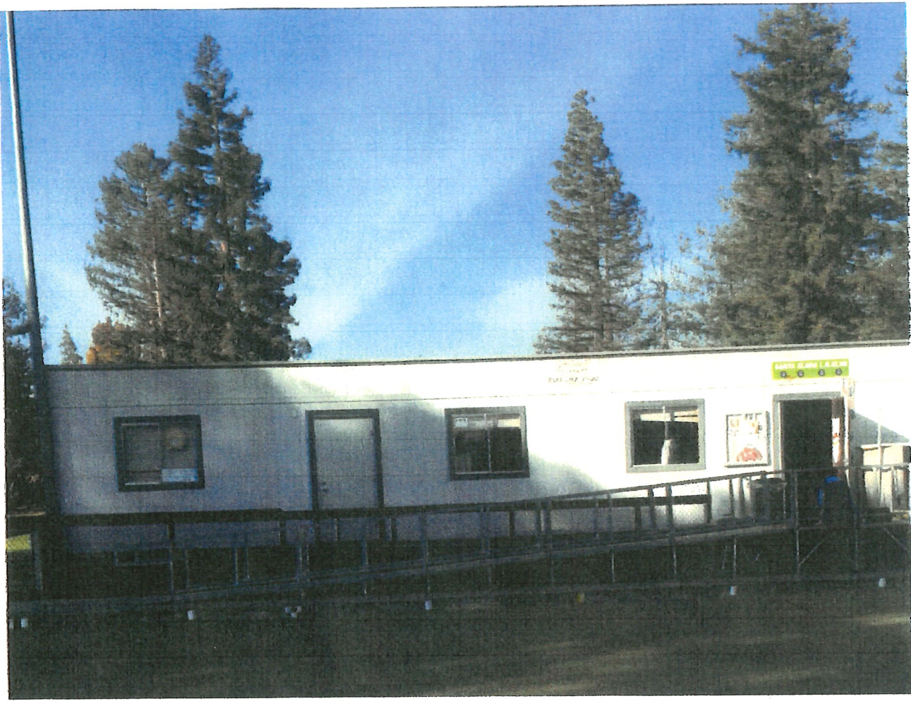
POST MEETING MATERIAL