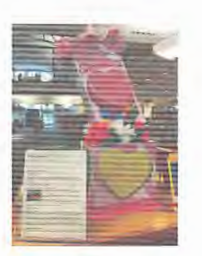
Kaiser Permanente Health & Wellness Collection & Programs