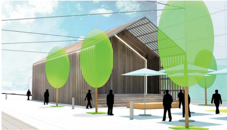
Wood Style Option