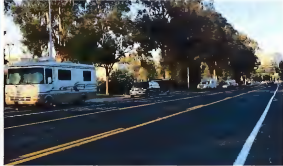
Recreational vehicles parking in Santa Clara