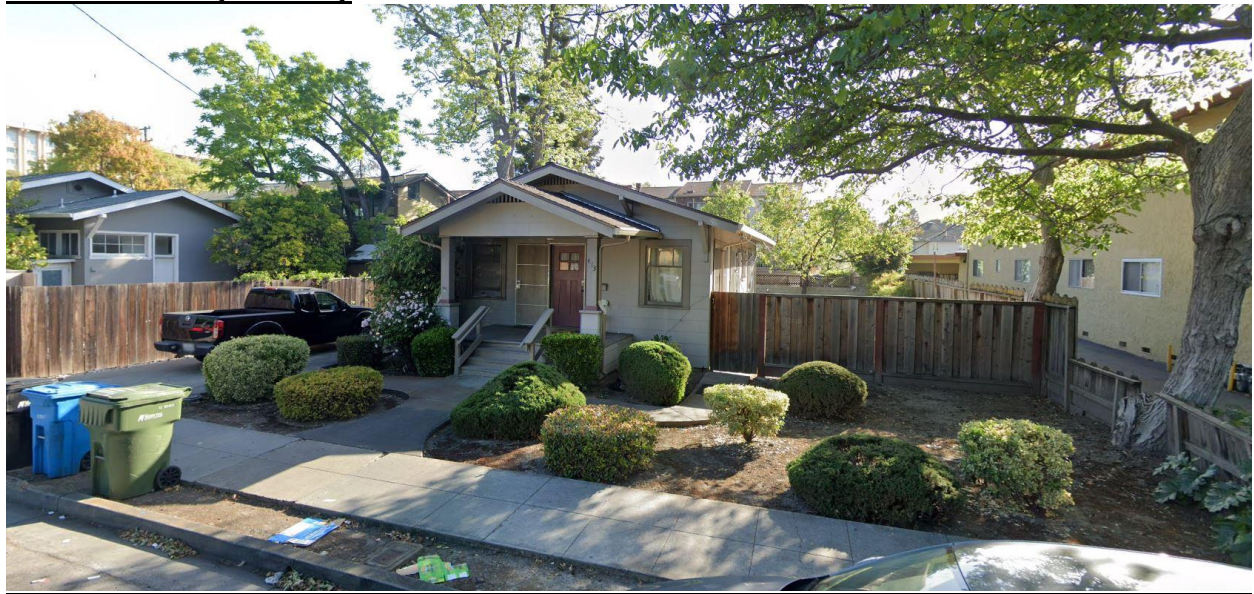
View from Lafayette Way