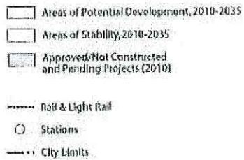
Figure 2.3-1 Areas of Potential Development