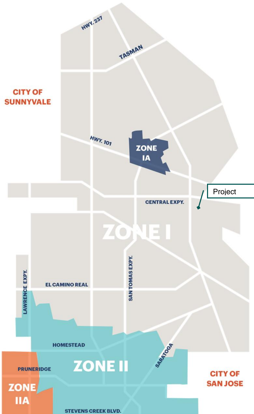
Figure 1: Pressure Zones