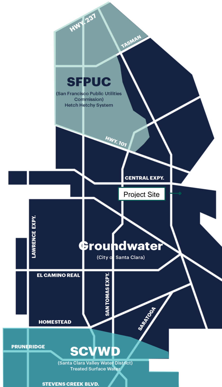
Figure 2: Sources of Water by Area