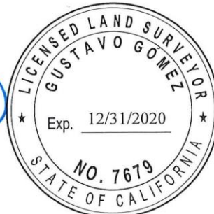
EXHIBIT Page 1 of 1