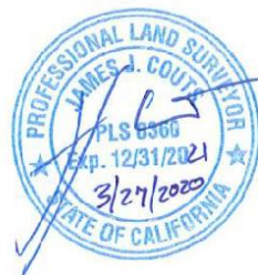
EXHIBIT A PAGE 2 by this reference made a part hereof.

Containing 3,468 square feet, more or less.