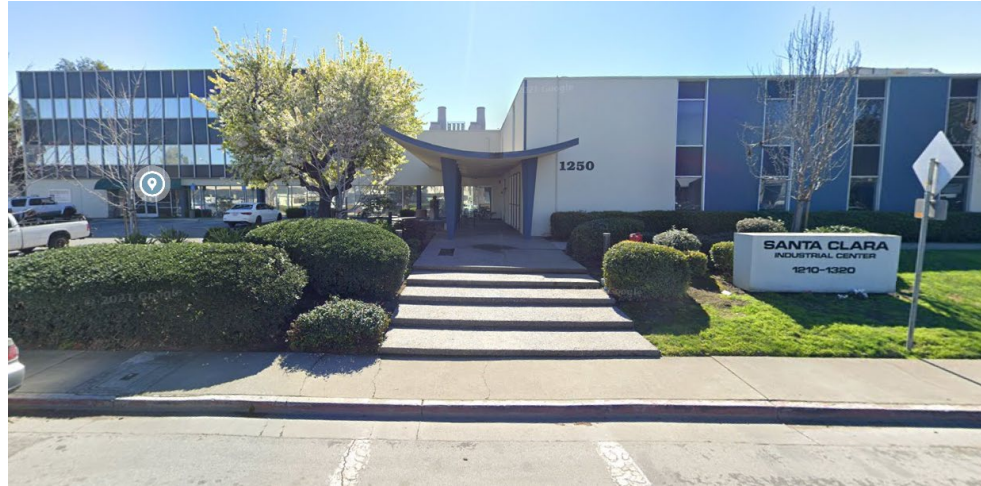
Memorex Drive Street View