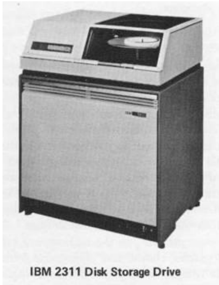
IBM 2311 Disk Storage Drive