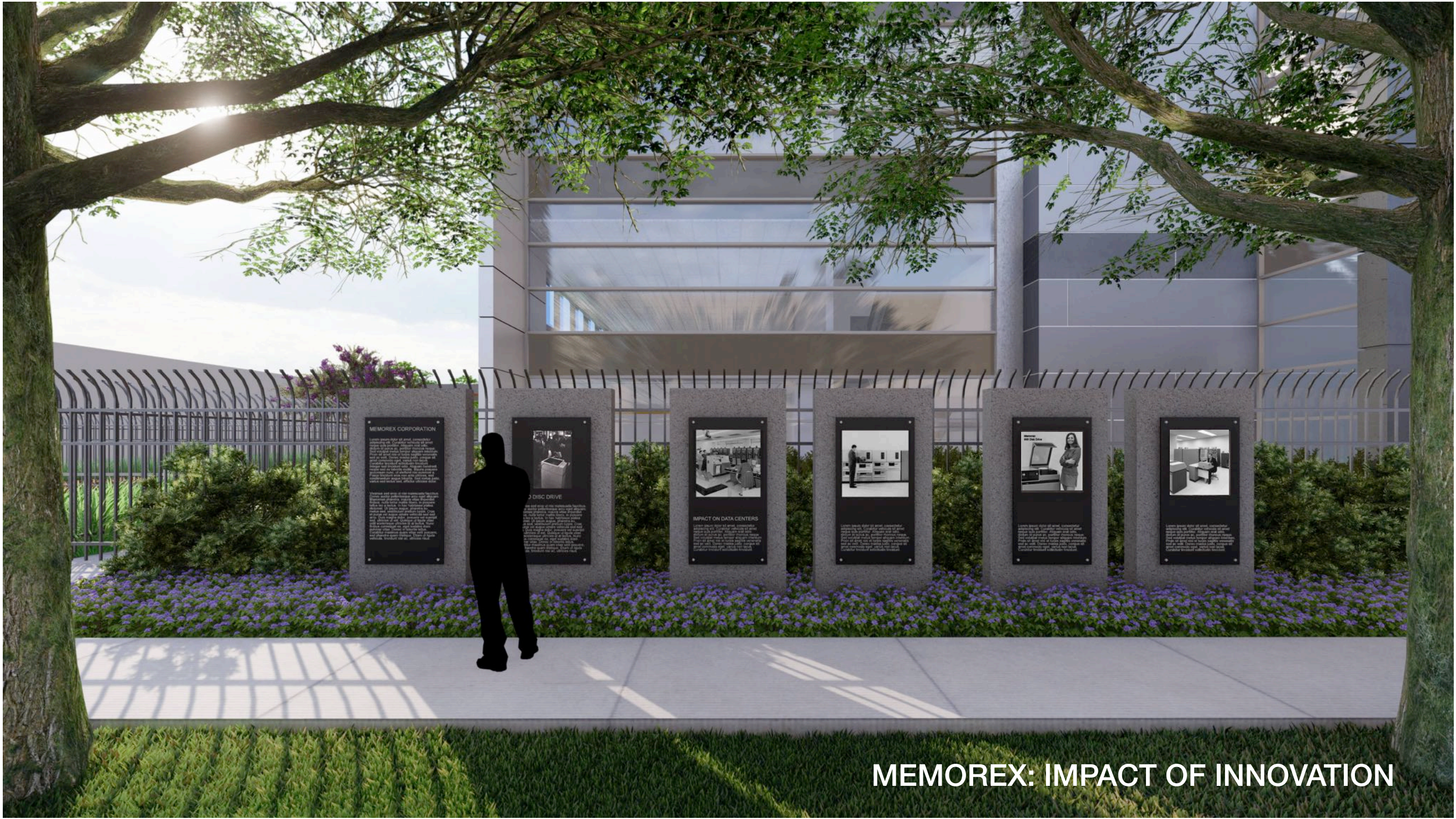
MEMOREX: IMPACT OF INNOVATION