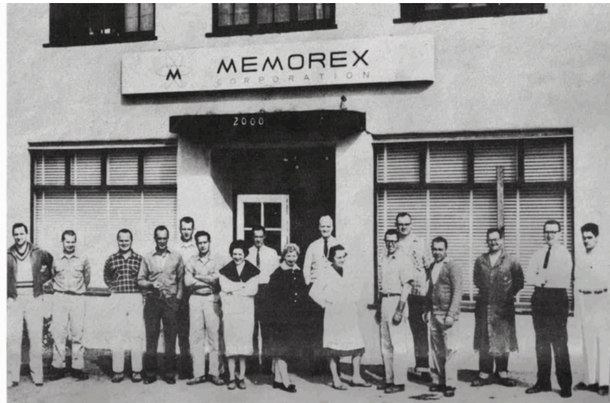
Memorex pioneers assembled in front of this early company facility for a group photograph in 1961. The prototype for Memorex's first precision tape coating line was built in this building in Mountain View while the company's first plant was being built in Santa Clara.