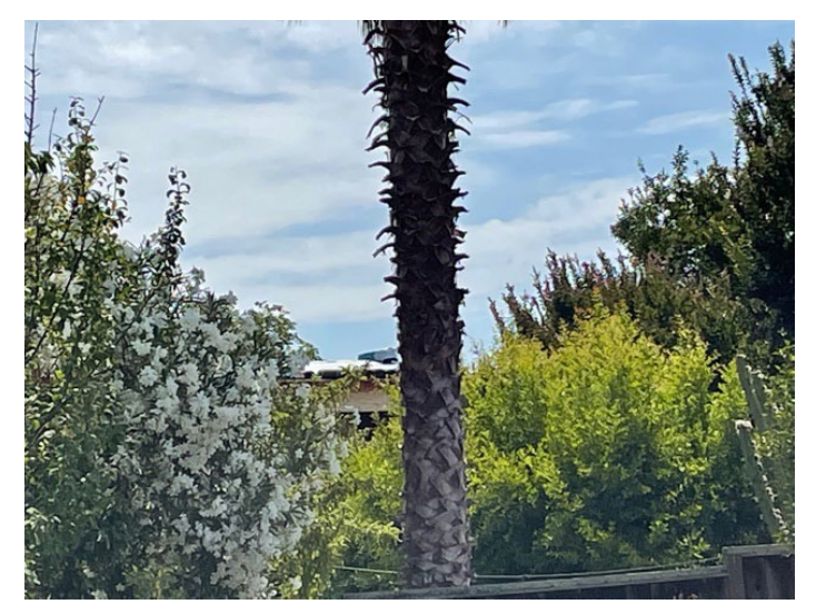
Sent from my iPhone