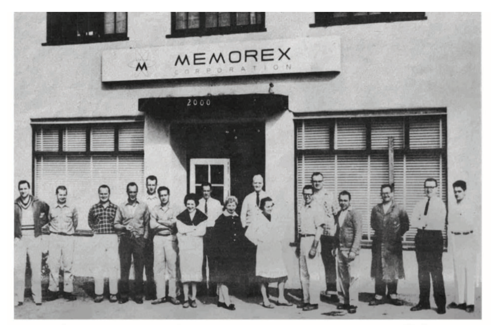
Memorex pioneers assembled in front of this early company facility for a group photograph in 1961. The prototype for Memorex's first precision tape coating line was built in this building in Mountain View while the company's first