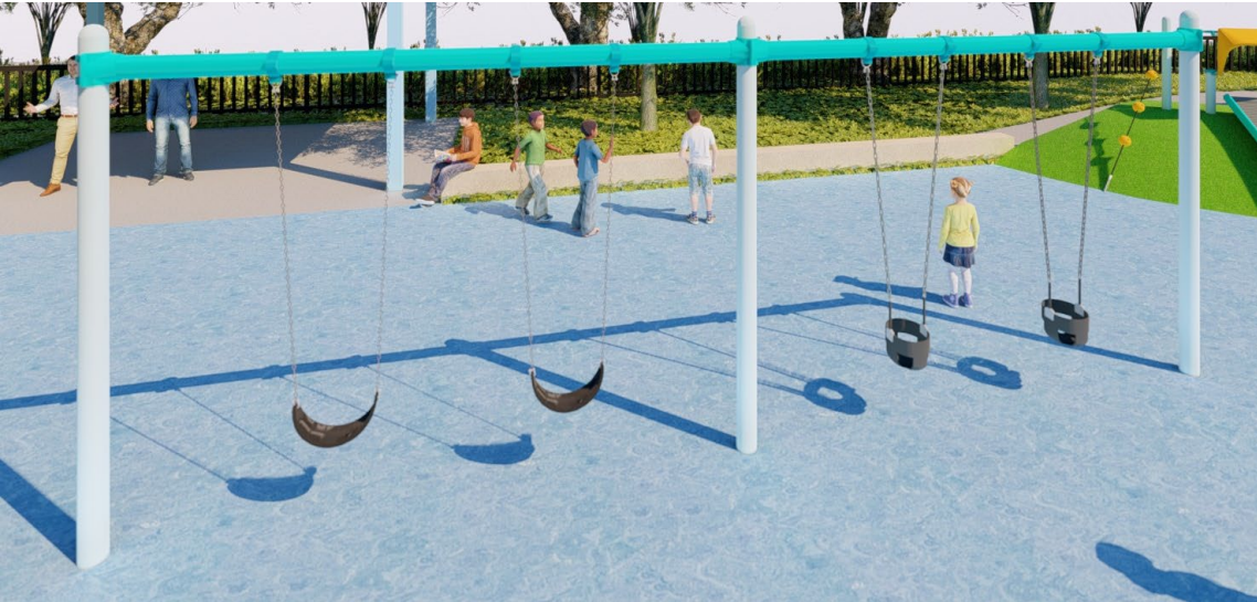
Swings for 6-12